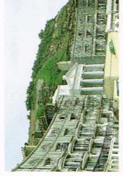
Restoring Pelham Crescent, with St Mary in the Castle Church as its centrepiece, is the Trust's top priority.

The Trust secures and administers grants for high quality renovation and enhancement work to historic buildings.