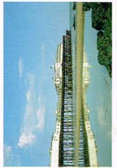
Hastings Pier. Securing its long-term future is one of the Trust's objectives.

The Trust will increasingly acquire, manage and develop property where this is helpful for supporting community regeneration initiatives.