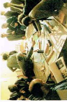
Planning for Real exercise on the Town Centre. Sponsored by the Trust, 1991.

The Trust provides expertise on urban regeneration to local groups, business, local authorities and national institutions, both in Hastings and elsewhere.