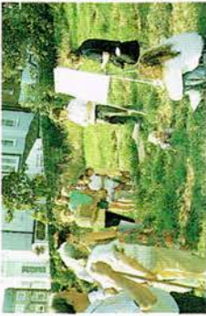
Residents planning a new community garden at Wallingers Walk on Castle Hill, 1989.

The Trust co-ordinates a wide range of environmental improvement projects including building conservation, landscaping, traffic calming and urban design.