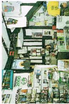
The Conservation Shop in Hastings Old Town

The Trust runs shops providing a range of goods and services relating to conservation, the local heritage and urban and rural regeneration.